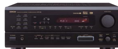
Front panel with terminal cover.

*Design and specifications are subject to change without notice.